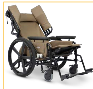
Front pivot seat tilt maintains user comfort with smooth, effortless tilt