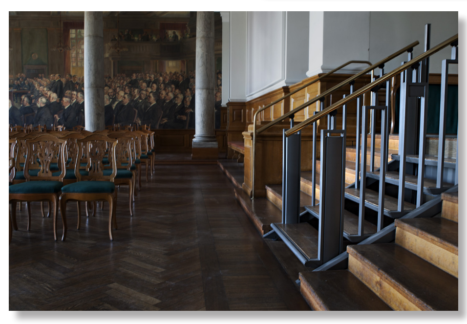
View a demonstration on www.bildnow.com