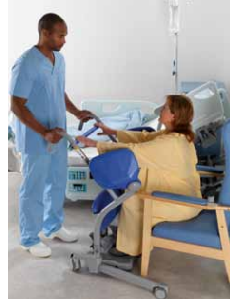
Approach the resident/patient, open seat flaps, open chassis legs and place the resident's/patient's feet on the footboard