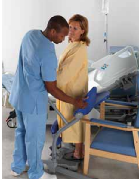
Position the Sara Stedy; apply castor brakes; raise the resident/patient with the help of the integrated handlebar; swivel the seat flaps into position