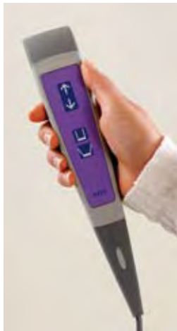
Dual controls. Handset or mast panel control? The carer can choose the most convenient control according to the situation.