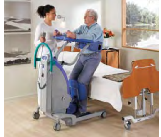
A single carer can manage transfers, safely and efficiently.

The sling is an integral part of the Comfort Circle, and a range of solutions is available to suit specific needs. In addition to the basic standing sling, a special BOS/EPS sling enables standing in a more upright position, which is more favourable for rehabilitation. The transfer/walking sling supports residents who need to be transferred in a seated position, and is also ideal for walking exercises.