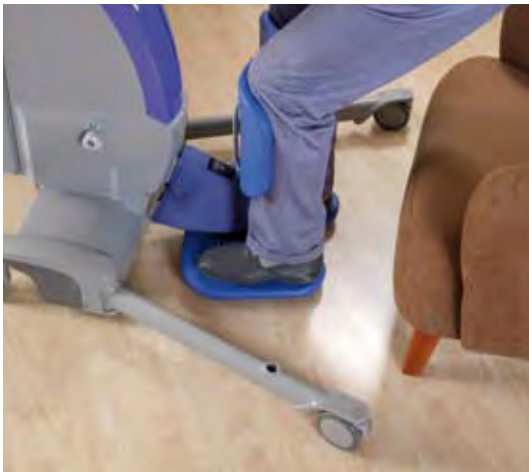
For transfers, the powered chassis can be opened for optimum access.