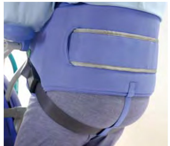
Supporting a more upright standing position makes the BOS/EPS sling ideal for rehabilitation.