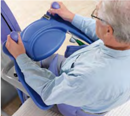
The Arc-Rest offers excellent support and promotes a sense of security.