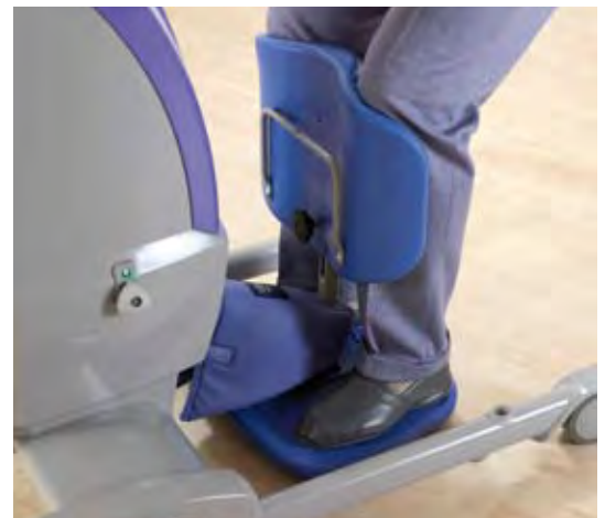
The footplate provides safety and stability, while the Pro-Active Pad allows natural flexion of the ankle.